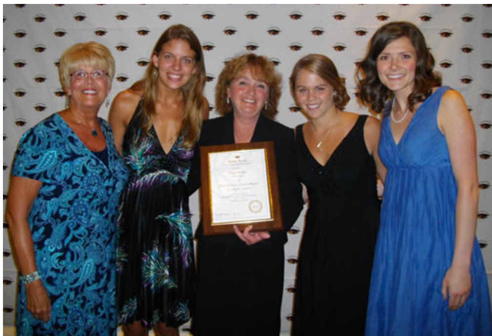
Hope College representatives accept the Ruth Weimer Mount Chapter Excellence Award at the 2010 Mortar Board National Conference in Chicago.