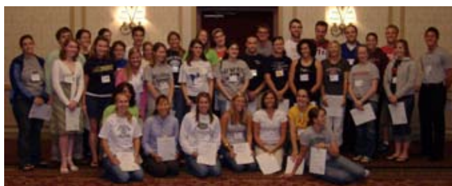
Delegates from 2006 Silver Torch Award chapters