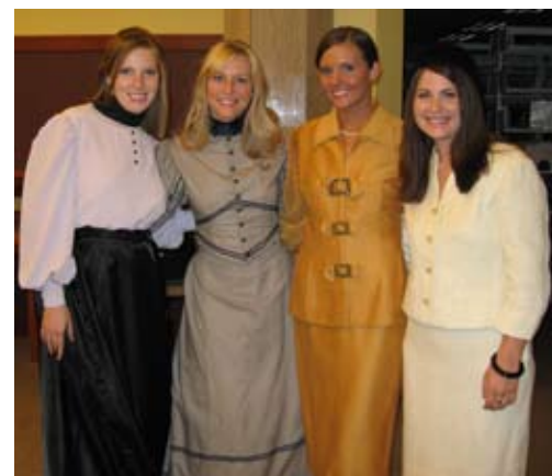
Kansas State University chapter members dress in vintage clothing at their Library Gala.

Members at the XIX chapter at Kansas State have a full calendar for the fall semester with both chapter traditions and innovative service programs. The chapter has already held alumni tailgates, assisted at the prestigious Landon Lecture Series, hosted the president's box at home football games and held a Library Gala complete with models of vintage attire. They will continue to support the Reading is Leading initiative by partnering with a local elementary school. The chapter is also planning a Self-Advocacy Workshop, fundraisers, finals week "study breaks" for K-State students and sponsorship of a family in need through the Flint Hills Breadbasket.