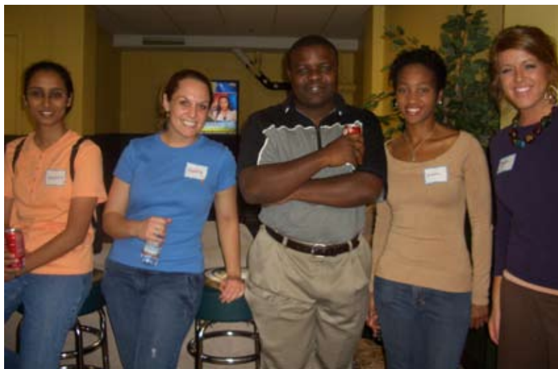
Baylor University members mingle with international students at a mixer they hosted.

The Laurel chapter at Baylor University celebrated International Students' Day by hosting an event complete with free food, drinks and games for Mortar Board members and international students. More than 30 international students were able to bowl, play pool and interact with chapter members in this fun, successful event.