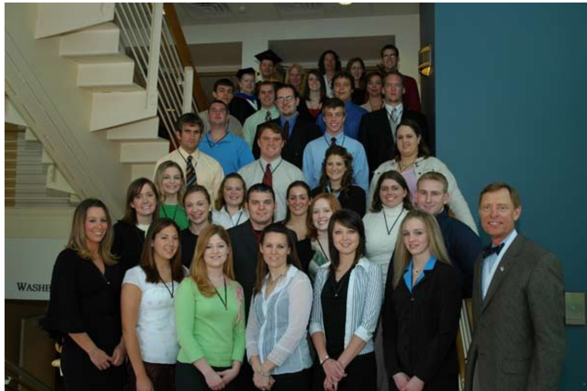
Washburn University's newest initiates, the class of 2007

Photos courtesy of Peggy Clark, Washburn University photographer