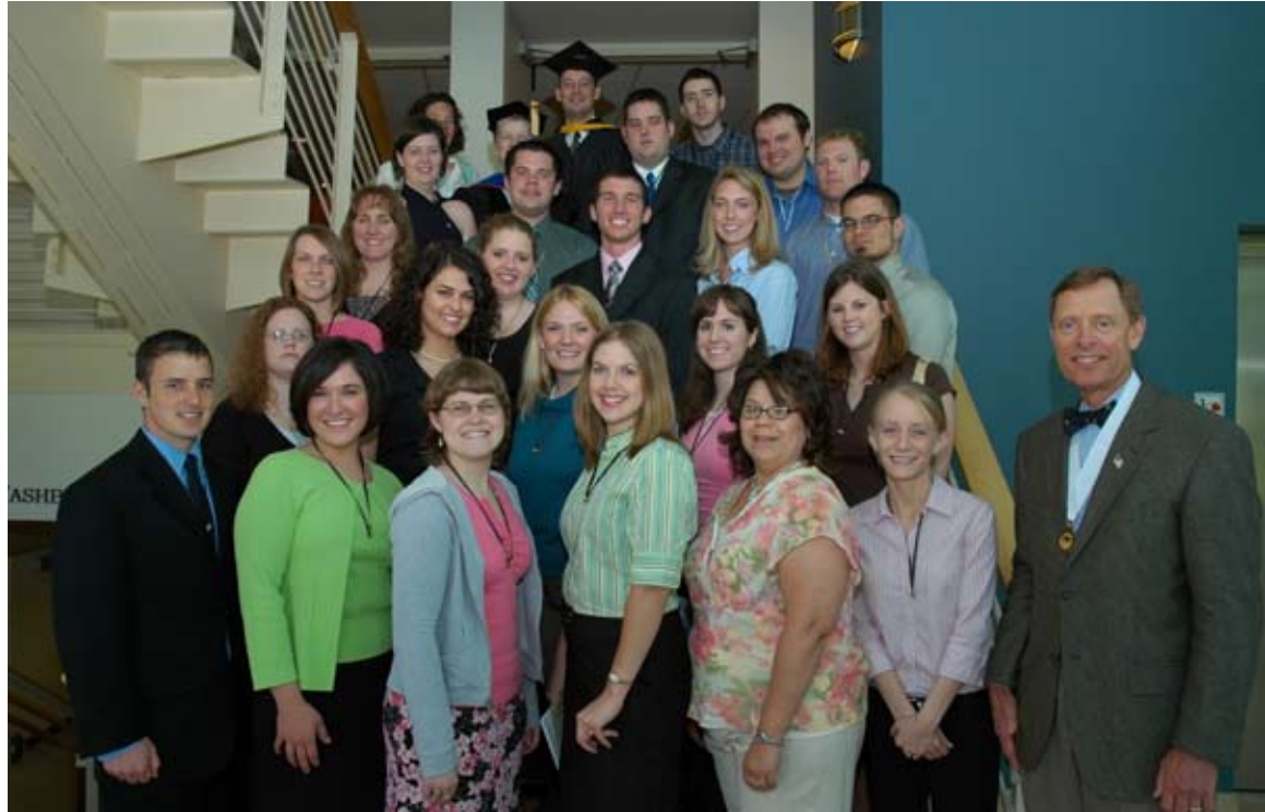
Washburn University's 2005-2006 class of founding members