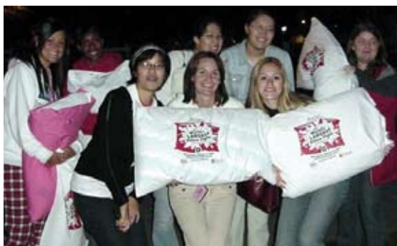
Ohio State University's chapter gave complimentary pillow cases to students at their World's Largest Pillow Fight attempt.

The Ohio State University's Mabel G. Freeman chapter was recently spotlighted by ESPN for their attempt to break the world record for the largest pillow fight. Although attempts fell short of the record, 1,760 enthusiastic students enjoyed a break from the first day of classes at the fight. The chapter was able to raise money and awareness for the Pancreatic Cancer Action Network.