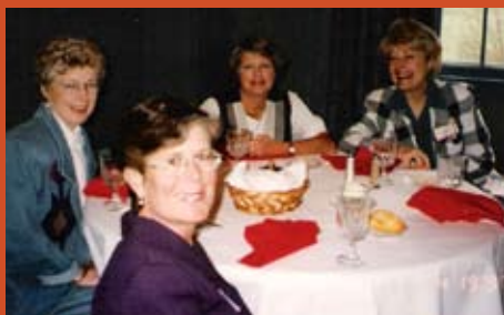
Muncie's 1997 alumni chapter members enjoy themselves at one of their favorite traditions - the tapping breakfast.