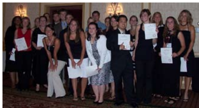
Delegates from 2006 Golden Torch Award chapters

Kansas State University Lyon College University of Minnesota University of South Florida University of Texas - El Paso